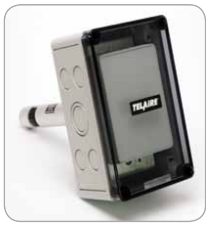
T1508 Aspiration Box for Duct Mounting

The Model 1508 is designed for in-duct sampling of CO_2 concentrations at flow rates greater than 400 fpm. Clear cover allows for observation of the sensor. They will accommodate any of the T8000-R series, and can be used for temperature and RH when fitted. Enclosure is screwed to the duct with probe inserted into air stream. Air sampling probe is 1-inch (25.4mm) diameter and 8-inch (203.2mm) long. Enclosure (ABS plastic) has knockouts for conduit connection. Note: Wiring penetrations must be sealed prior to use. CO_2 sensor not included.