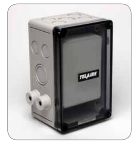
T1505 Splash Resistant Enclosure and T1552 Outside Air Enclosure

The Model 1552 is a rugged weatherproof enclosure (ABS plastic), designed to allow the T8100 series sensor to operate in an outdoor environment and/or where ambient temperatures are below freezing. The 1552 is ideal for monitoring outside air or CO_2 as a surrogate for combustion fumes in parking garages, tunnels and loading docks. This enclosure features a temperature control circuit and internal heaters to maintain the sensor within its normal operating temperature range, even if temperatures outside the enclosure are as low as -20°F (-29°C). Four diffusion ports allow for entry of CO_2 . Response time of the sensor is slowed to approximately 30 minutes to measure a 90% step change in concentrations. Enclosure is designed to screw directly to a wall. CO_2 sensor not included. Power consumption is 24V, 1.5 Amp (max), and includes the T8100 series.