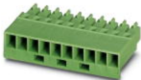
The illustration shows a 16-position version

Plug component, Nominal current: 8 A, Rated voltage (III/2): 160 V, Number of positions: 3, Pitch: 3.81 mm, Connection method: Crimp connection, Color: green, Corresponding female crimp contacts with current [A] and conductor cross section range [mm²] data: 5A/MCC-MT 0,2-0,35 (1859988); 8A/MCC-MT 0,5-1,0 (1859991)