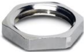
M10 flat nut

Please be informed that the data shown in this PDF Document is generated from our Online Catalog. Please find the complete data in the user's documentation. Our General Terms of Use for Downloads are valid ( http://phoenixcontact.com/download )